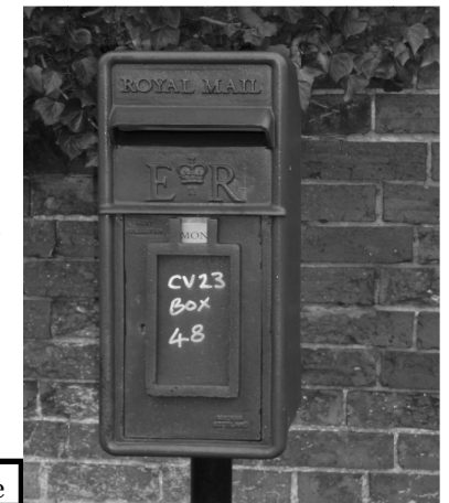
GR Letterbox, Sawbridge

Follow the track bearing R and cross over Canal bridge No. 98. At this point the canal goes L to Napton Junction and R to Braunston. Stay on the track following the line of telegraph poles that switch L to R at the pond L and gateway. Looking straight ahead on the track you can see the spire of St. Peters, Grandborough, framed by two Wellingtonia trees.