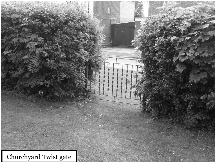
Churchyard Twist gate

Follow the road L for approx. 1.6km to the Ridgeway track on the L (unclassified county road). At the furthestmost side of the Ridgeway track, go through the metal kissing gate into the field. Bearing R of the telegraph pole ahead go diagonally across the field. As you gain height St Peters spire will come into view. Continue to the corner of the field, skirt around the back of the metal sheepfold and go through the metal kissing gate into the next field. Follow the hedgerow R . At the corner of the field exit R onto the road by the metal field gate. Turn L and cross the two bridges. There is no pathway here until you are past the 2nd bridge and can then join the causeway on the L over the ford. At the sharp R bend on Main Street , enter the churchyard by the metal gate and follow the path through the graveyard. At the front of the church and the stone wall bear L across the grass to the metal twist gate. Bear L and then turn R at the public footpath sign ( The Lane ). Follow this back to the Shoulder of Mutton .