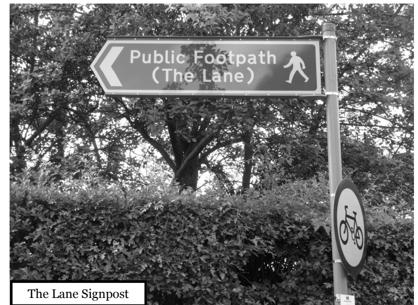
The Lane Signpost