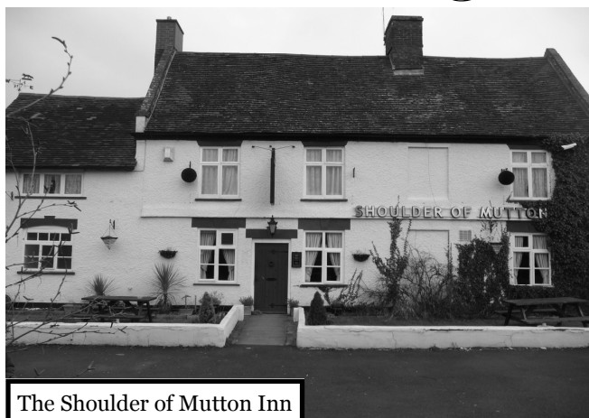
The Shoulder of Mutton Inn

A circular walk of approx 13km (8 miles) R = Right, L = Left. Allow between 2.75 and 3.25 hours.